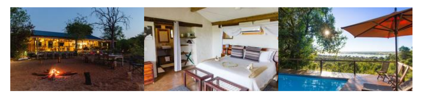
Day 6-9 Safari Life En-suite Tented Safari Khwai, Khwai Community Area